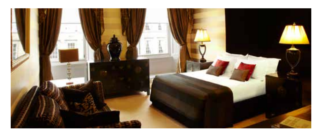
WALDORF ASTORIA - THE CALEDONIAN

In addition there are two drawing rooms, a conservatory, a dining room, snooker and meeting rooms. This all combines to make the ideal luxury hideaway in stunning countryside far from the major towns.