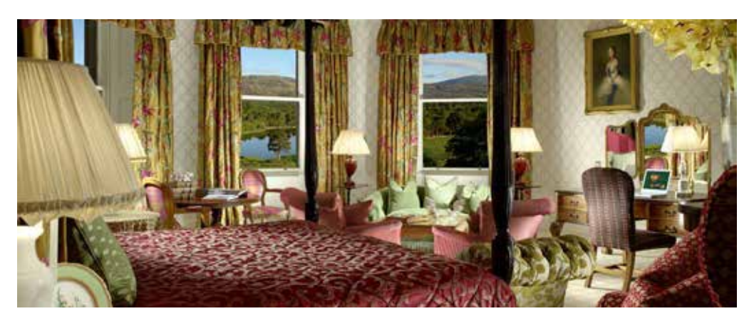
INVERLOCHY CASTLE HOTEL

This wonderfully traditional country house is the perfect destination to live the life of the aristocracy. See how life was hundreds of years ago and spend time with the Duke and Duchess finding out about their family history