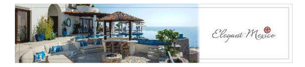
5-star dining atop 5-star hotels