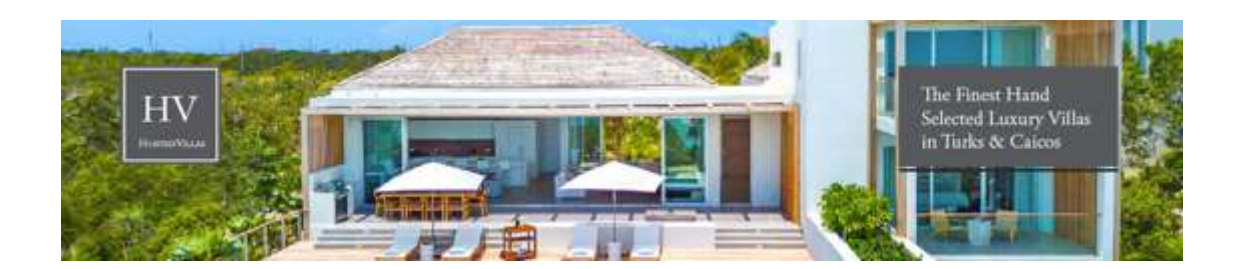
Five bedrooms of luxury in Turks & Caicos