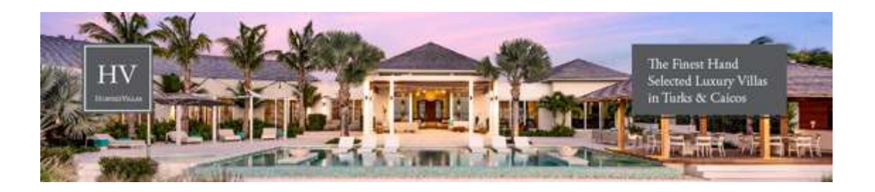
Sentosa Villa on the famous Grace Bay