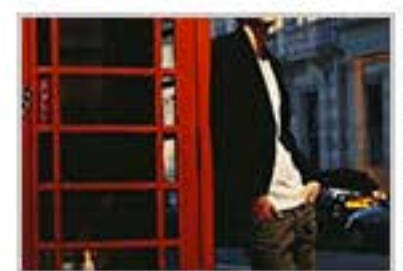
London Food Roundup