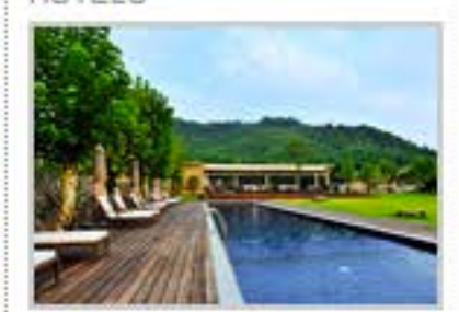
Naked Stables Private Reserve