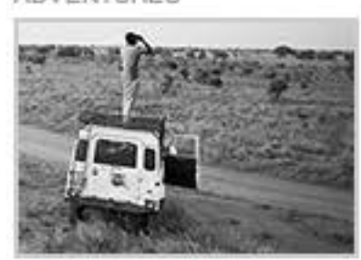
Mobile Safari Expedition