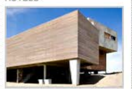
The Clubhouse: Punta