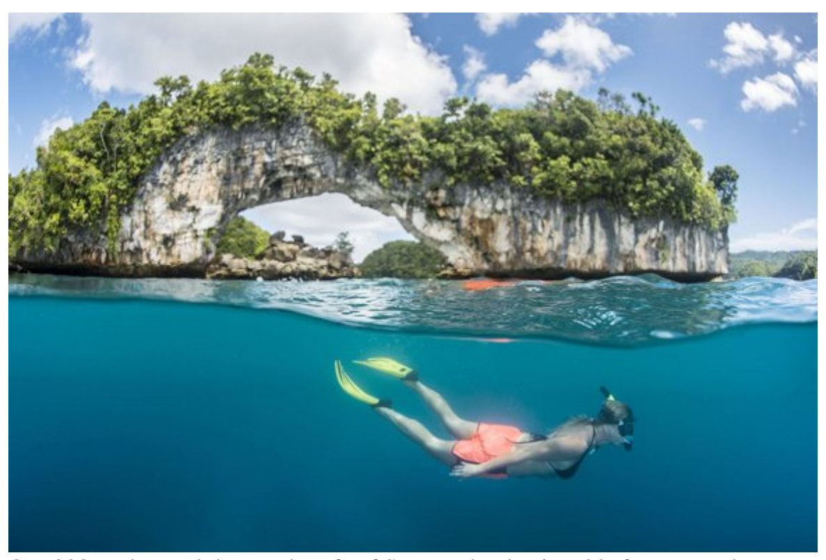
£96,000: Palau and the coral reefs of Seven Islands via a 227ft superyacht (Antonio Husadel) Tanzanian safari

This guided group trip treks, kayaks and rafts across South Island, visiting Kaikoura, Abel Tasman National Park, Cape Foulwind, the Southern Alps and Fiordland, with optional heli-hiking and whale-watching. Prices start at £5,075pp for 11 nights, including flights, most meals and activities.