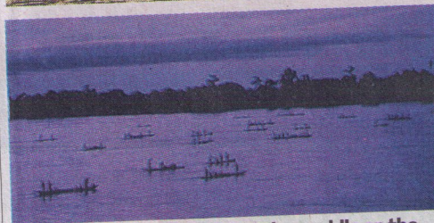
Box clever: learn to fight in Cuba, paddle on the Congo and swim to Alcatraz in San Francisco