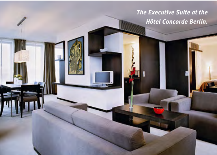
The Executive Suite at the Hôtel Concorde Berlin.