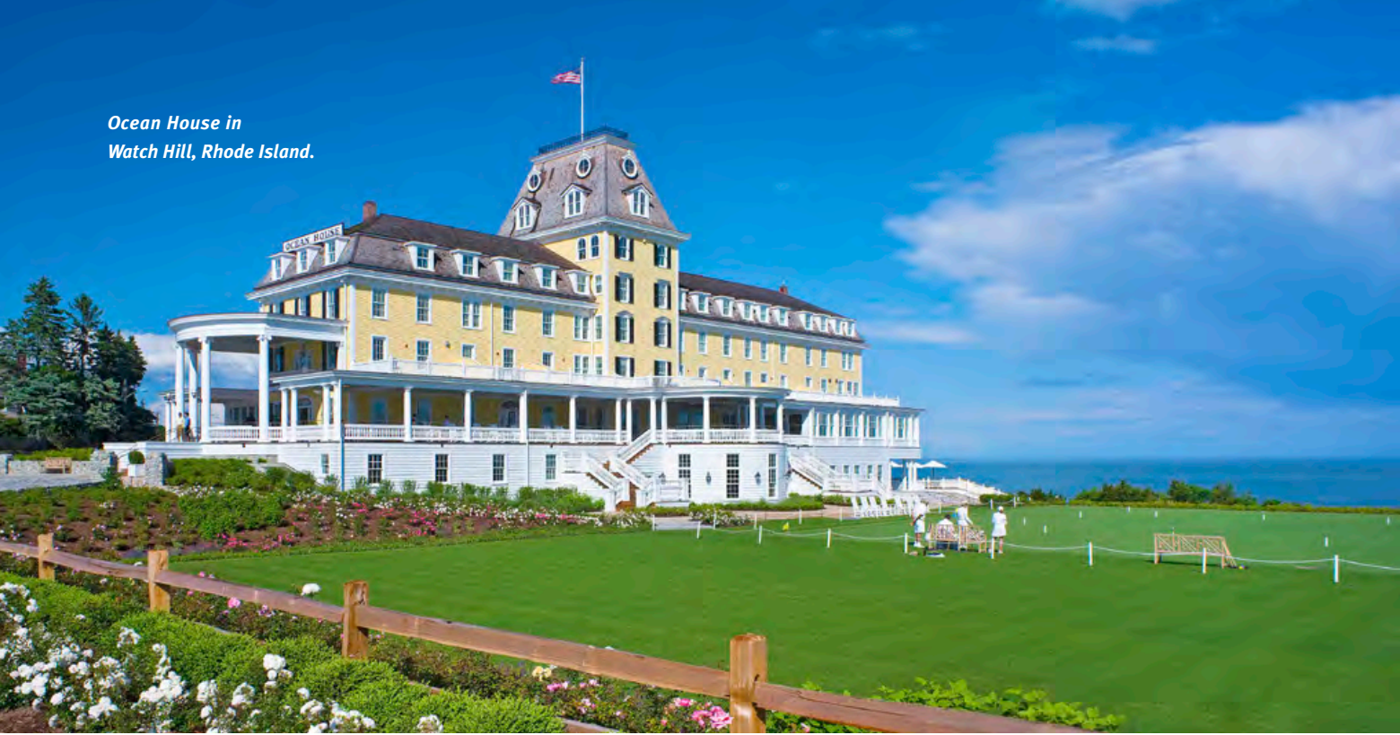
Ocean House in Watch Hill, Rhode Island.

terrace and enjoy the singular experience of an Ocean House honeymoon—all just a few sweet hours from home. —A.B.