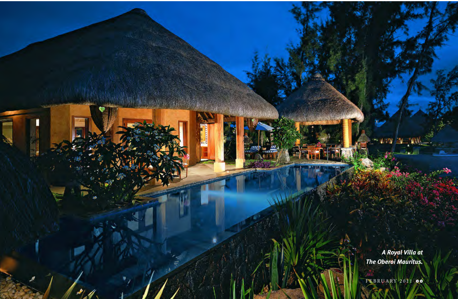
A Royal Villa at The Oberoi Mauritius.