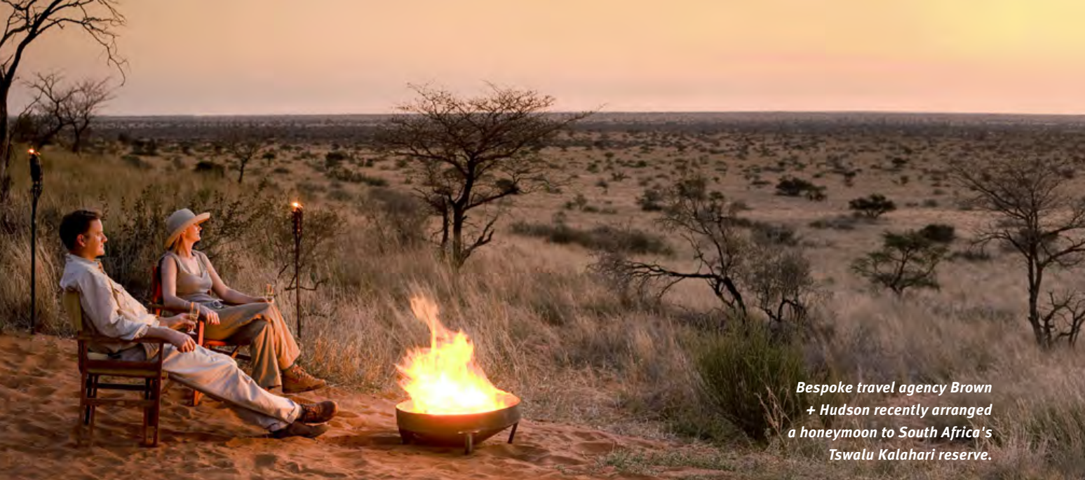
Bespoke travel agency Brown + Hudson recently arranged a honeymoon to South Africa's Tswalu Kalahari reserve.