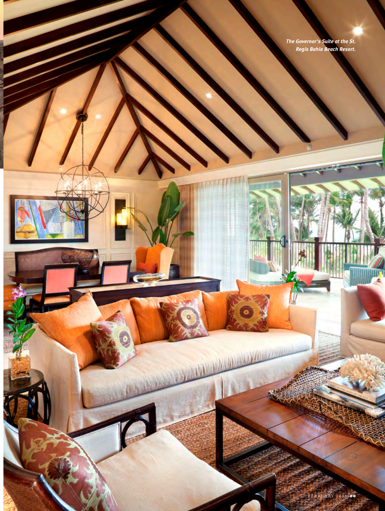
The Governor's Suite at the St. Regis Bahia Beach Resort.