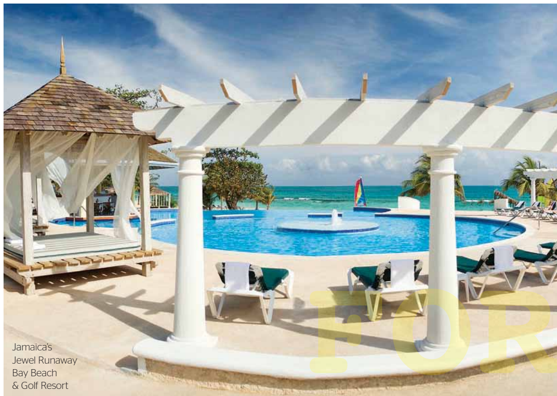
Jamaica's Jewel Runaway Bay Beach & Golf Resort