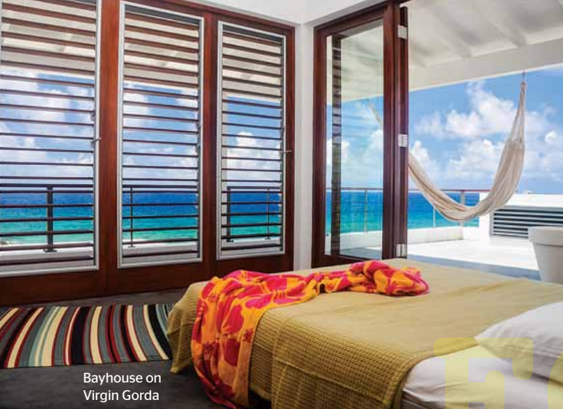
Bayhouse on Virgin Gorda