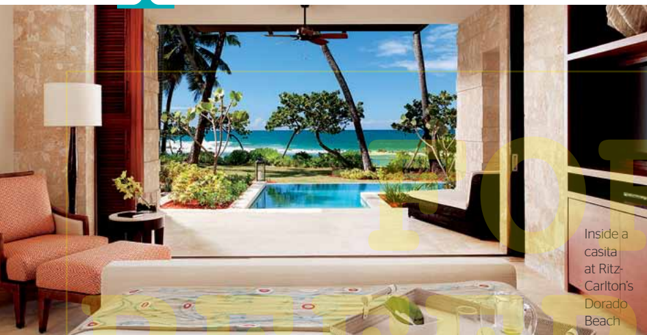
Inside a casita at Ritz-Carlton's Dorado Beach

How can you possibly resist? We tempt you with this season's most promising openings.