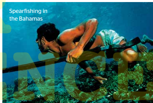
Spearfishing in the Bahamas