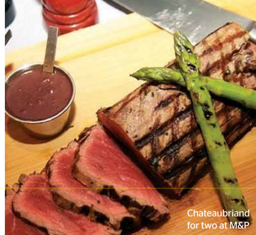
Chateaubriand for two at M&P

First came the Pete Dye golf course, opened in 2011. Next up: 36 rooms and 11 villas coming soon to this oceanfront north-shore resort. Villas feature private plunge pools , but all guests have access to two infinity pools, a 1,000-foot beach , two restaurants, and the Mesoamerican Reef just offshore. From $295. 855-224-6620; las-verandas.com