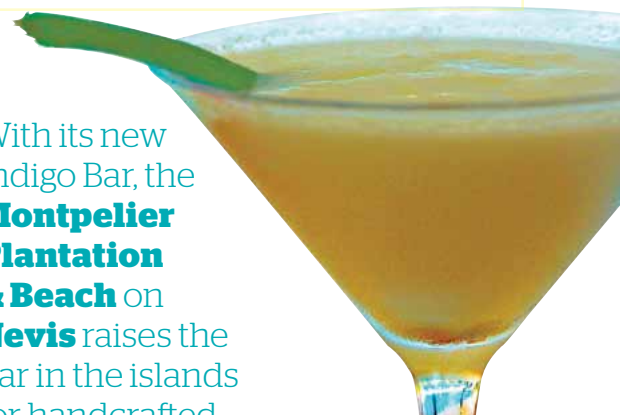
JACQUES ZOLTY (CHATEAUBRAND)

With its new Indigo Bar, the Montpelier Plantation & Beach on Nevis raises the bar in the islands for handcrafted cocktails. House-infused liquors feature local organics in combinations such as cucumber gin and watermelon vodka. Order them as bottle service for two in size-appropriate servings. Or try the Jellytini ( above ), featuring the coconut "jelly" fruit straight from the shell mixed with two kinds of rum. 869-469-3462; montpeliernevis.com