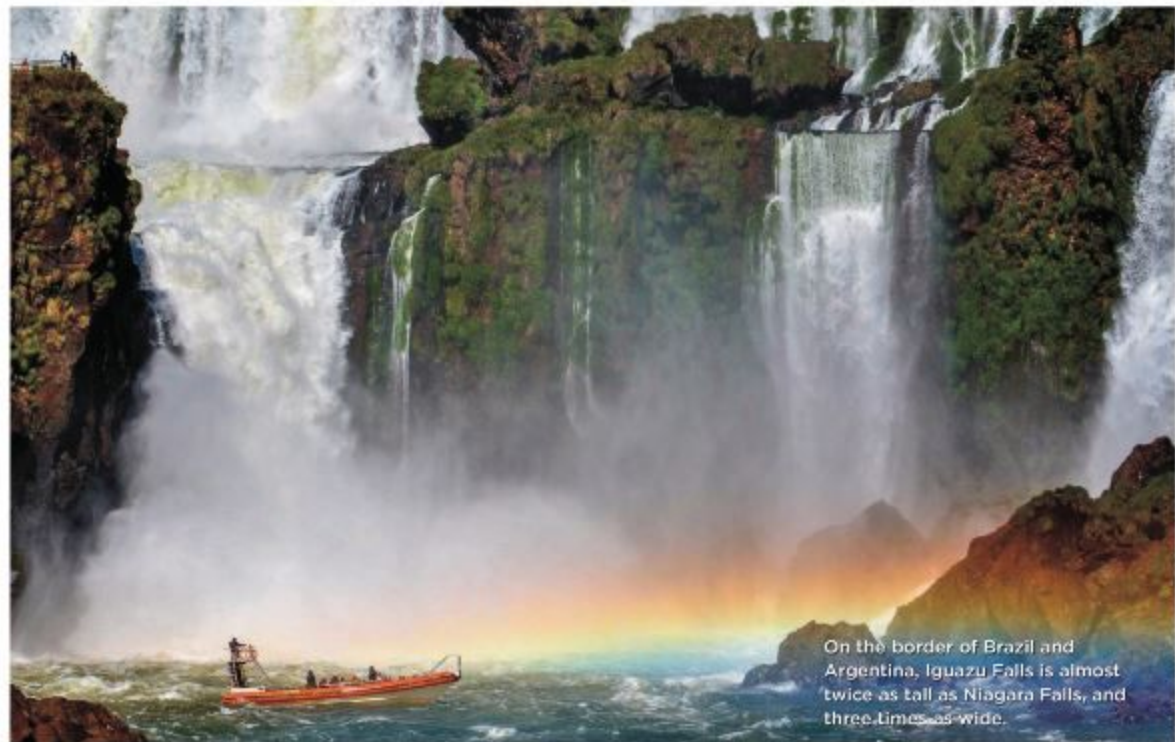
On the border of Brazil and Argentina, Iguazu Falls is almost twice as tall as Niagara Falls, and three times as wide.