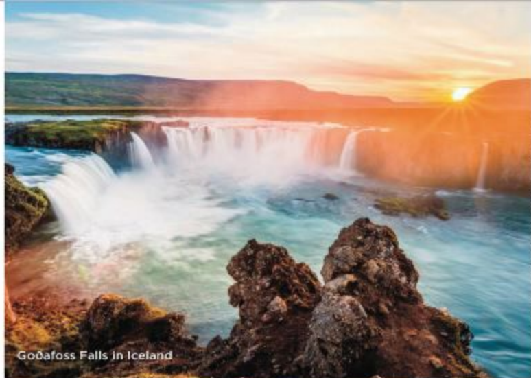
Goðafoss Falls in Iceland

"The coldest months are December, January and February; however, at this time you can enjoy an unforgettable spectacle of a frozen waterfall," says Brunning. "Also, the summer is a perfect time due to the longest duration of daylight. Try to get there at sunrise to watch the sun begin to shine straight through the canyon onto the waterfall."