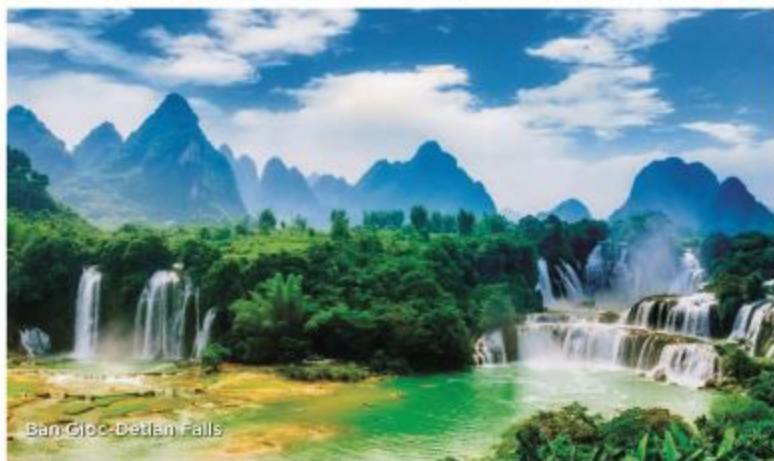
Ban Gioc-Detian Falls