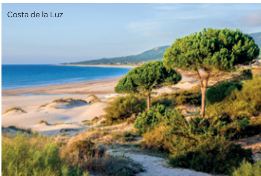
Costa de la Luz