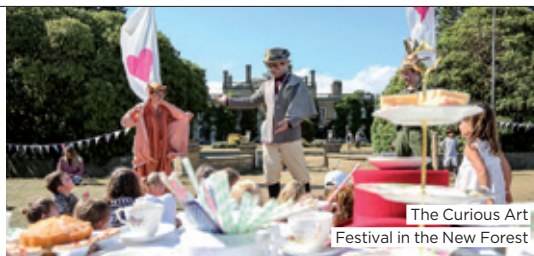
The Curious Art Festival in the New Forest

» One of the country's most enchanting and eclectic festivals of literature, music and comedy lifts off at Pylewell Park. Glamp in a luxury tent or a vintage camper van and make a New Forest weekend of it. 20-22 July. curiousartsfestival.com