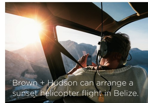
Brown + Hudson can arrange a sunset helicopter flight in Belize.