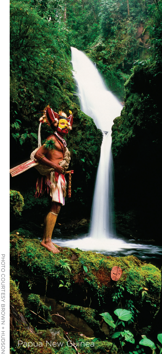
Papua New Guinea

"You're in one of the least explored regions on the planet and can pretty well count on being the first outsider to experience many places," Brown + Hudson says of Papua New Guinea.