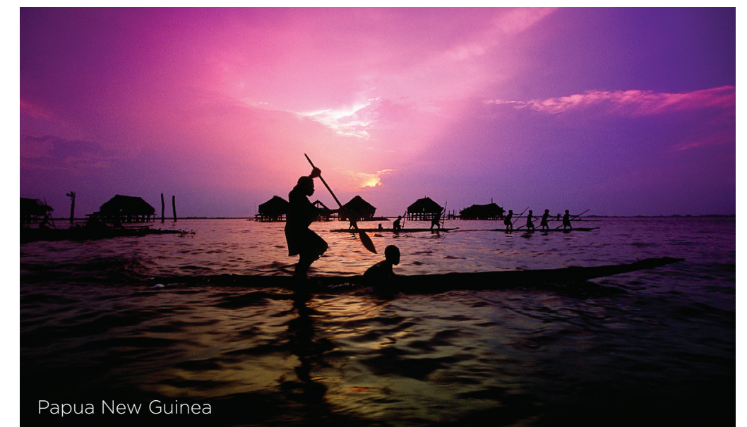
Papua New Guinea